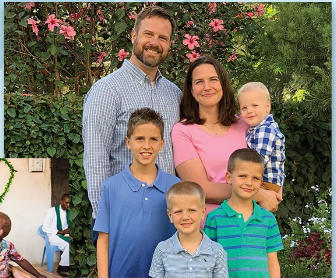
The Trump Family

Dear Brothers and Sisters of St. Paul, Greetings in Christ from Nairobi. Our family is well and safe & we pray the same for you. In the midst of the current restrictions, we are grateful to be able to support churches across Africa in food distributions, hygiene needs and radio broadcasts. Thank you for your prayers, encouragement and support.